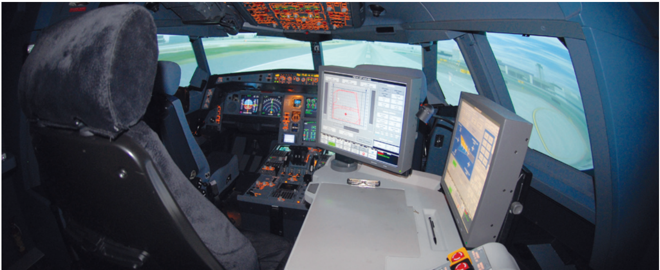
Instructor operator station (IOS) update completed