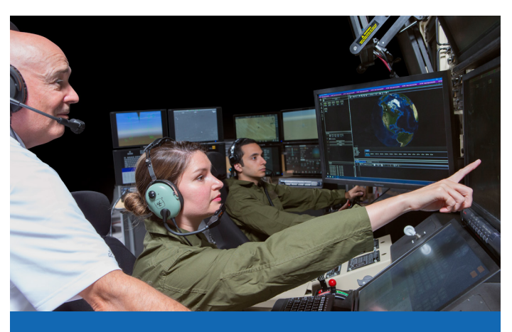
Unprecedented Instructor Experience Purpose-Built for RPA Systems