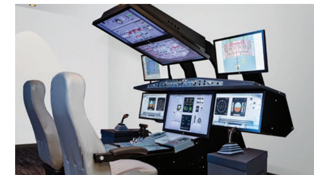
Including optional tactile primary flight controls and FMS display units