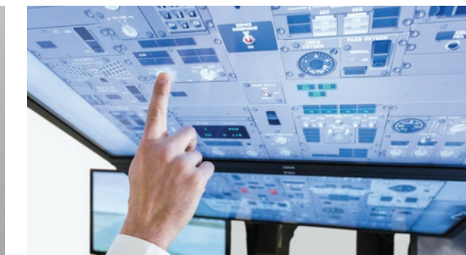
Including optional CAE Tropos™ 6000XR visual monitors