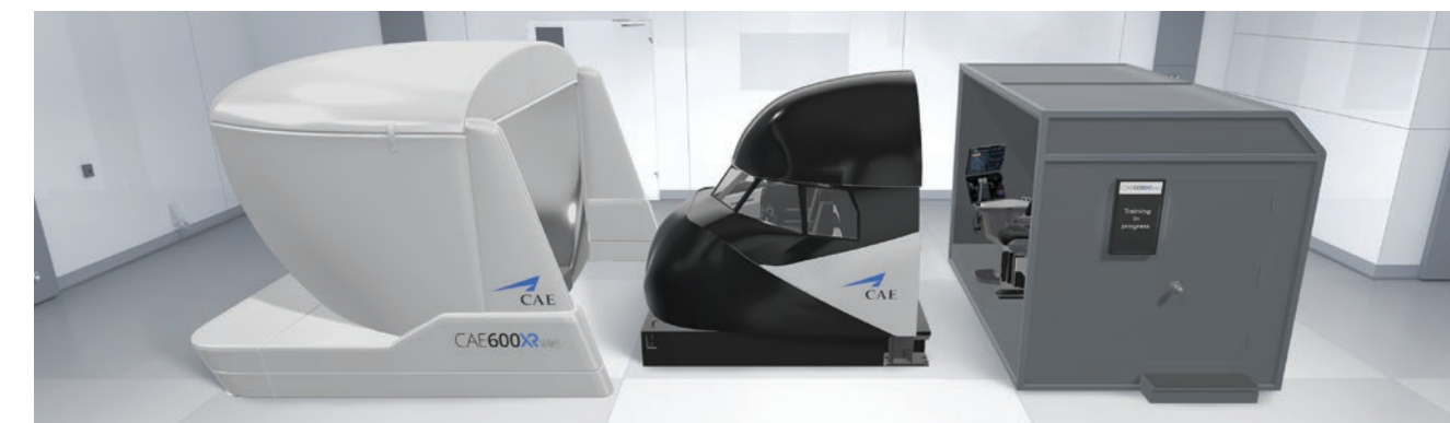
Including optional CAE Tropos™ 6000XR collimated visual system and enclosed instructor area (Exploded view for illustration only)