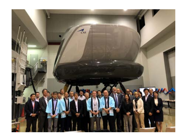
Japan Airlines, Jetstar Japan, Air Asia Japan and CAE management teams

With this training equipment addition, CAE Tokyo-JCFT will provide Boeing 737NG, 767, 777, 787 and Airbus A320 pilot training, bringing the total number of FFSs available at the centre to 9.