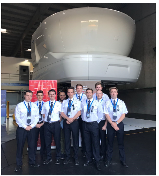
Cadets in training at CAE Madrid

CAE Madrid is home to one of three of CAE's ab initio academies in Europe, following the highest industry pilot training standards in the world. Leveraging its global training network, CAE delivers cost-effective training programmes in region, from classroom to type-rating training, close to operators' base. Capitalizing on its rigorous assessment process, the experience of its professional instructors, its comprehensive training programmes supported by an English language preparatory course, CAE ensures the highest cadet success rate, driving the highest ab-initio pilot graduation and placement rate in the industry.