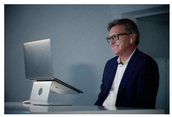
CAE becomes first Canadian aerospace company to become carbon neutral. CAE's President and CEO sat down with employees and their children for a live virtual discussion on the environment and CAE's commitment