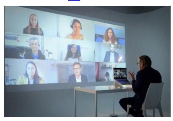
CAE becomes first Canadian aerospace company to become carbon neutral. CAE's President and CEO sat down with employees and their children for a live virtual discussion on the environment and CAE's commitment.