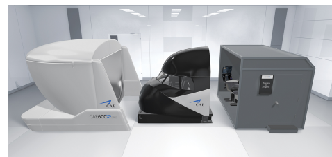
Including optional CAETropos™ 6000XR collimated visual system and enclosed instructor area. Exploded view for illustration only.