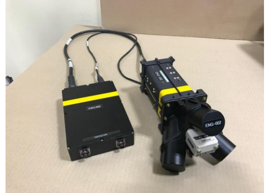
CAE MAD-XR is significantly more compact than previous MAD systems and will now be integrated on the U.S. Navy's MH-60R helicopter for use in submarine detection.

CAE's Defence & Security business unit focuses on helping prepare our customers to develop and maintain the highest levels of mission readiness. We are a world-class training and mission systems integrator offering a comprehensive portfolio of training and operational support solutions across the air, land, sea and public safety market segments. We serve our global defence and security customers through regional operations in Canada; the United States/Latin America; Europe/Middle East; and Asia-